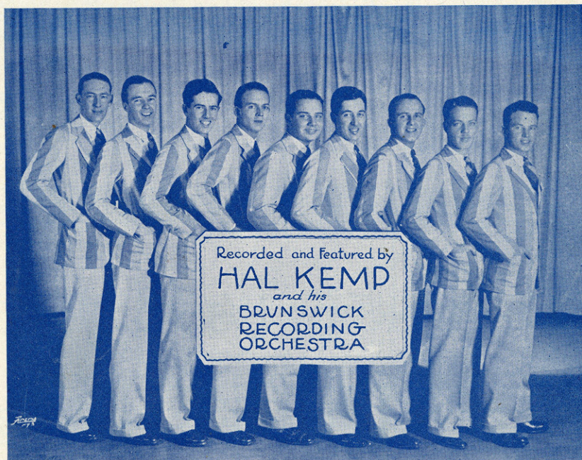
Recorded and featured by HAL KEMP and his BRUNSWICK RECORDING ORCHESTRA