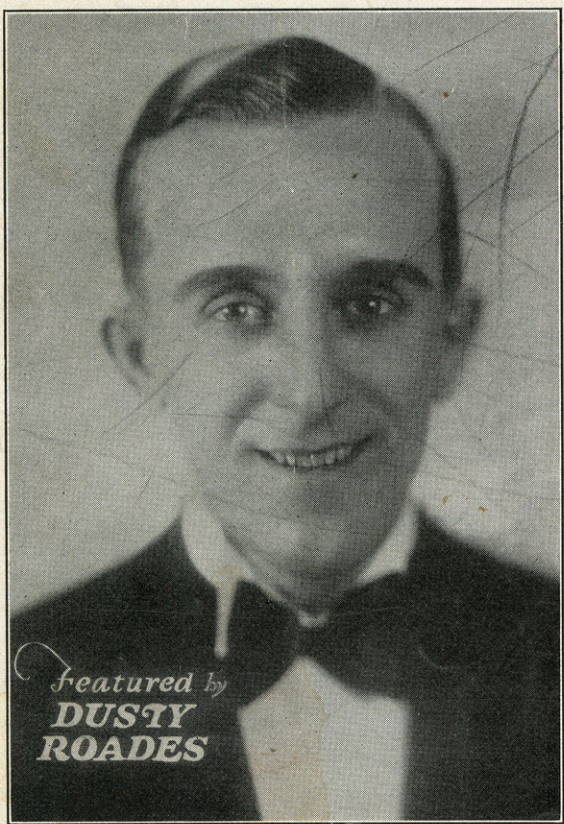
Featured by DUSTY ROADES