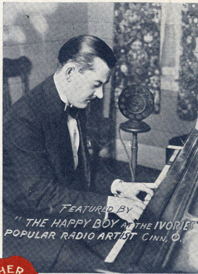
FEATURED BY "THE HAPPY BOY AT THE IVORIES" POPULAR RADIO ARTIST CINN., O.