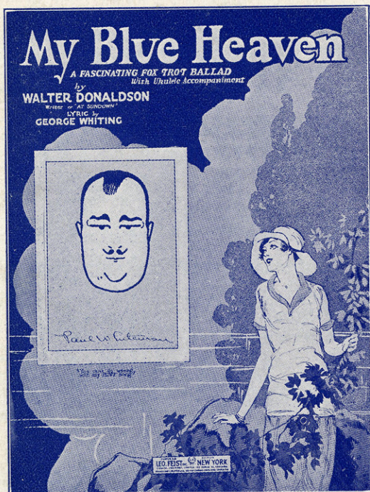
The Waltz Ballad Supreme! A Shady Tree