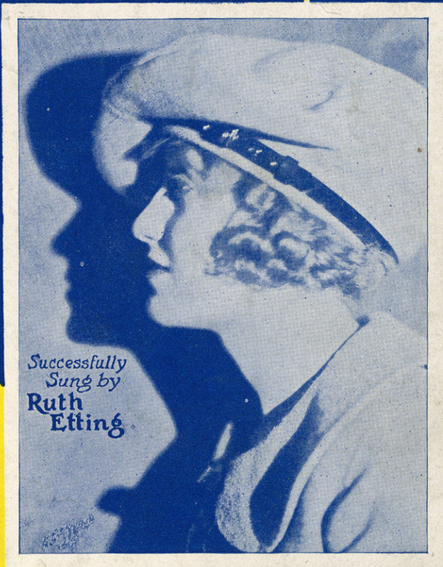
Successfully Sung by Ruth Etting

Words by Gus Kahn writer of "Toot-Toot-Toolsie" and "Swingin' Down The Lane"