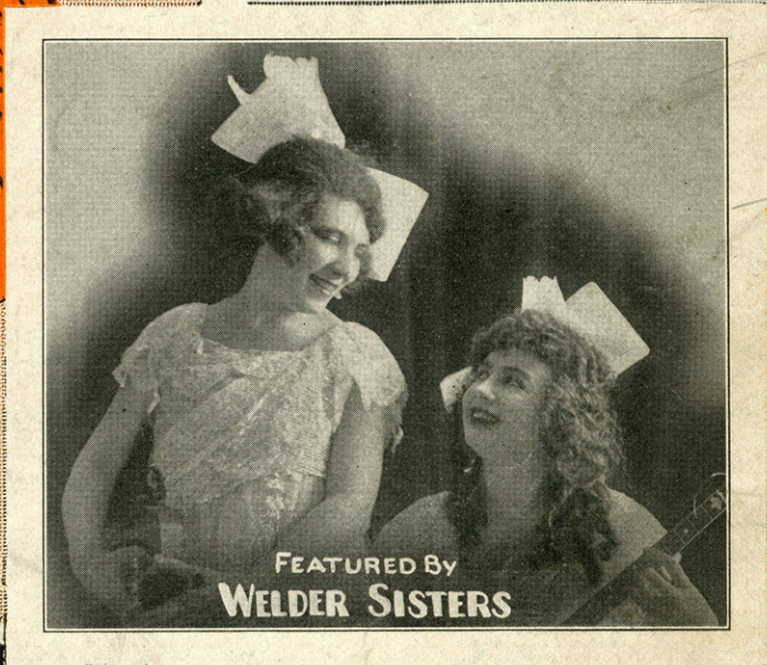
FEATURED BY WELDER SISTERS

Words by Gus Kahn Music by Walter Donaldson