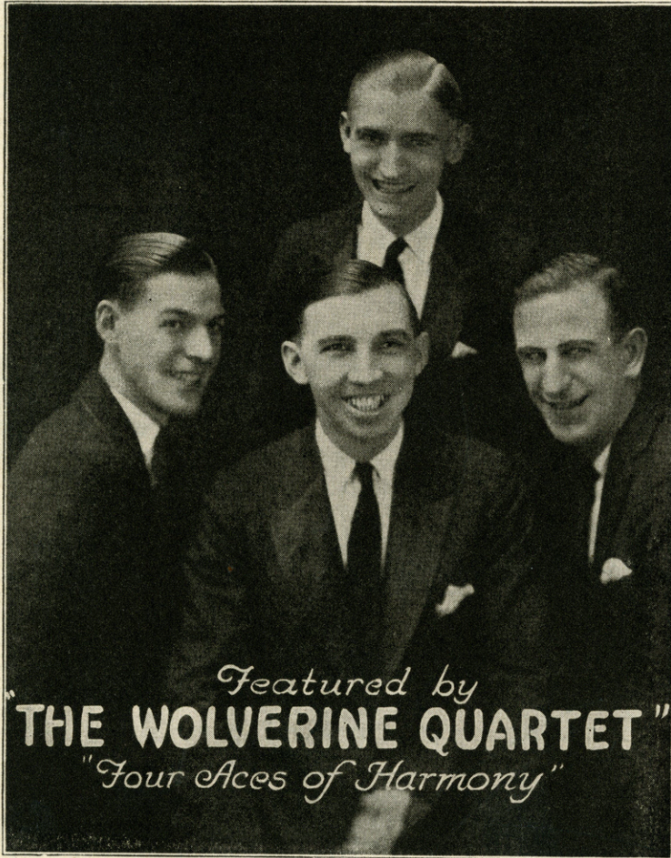
Featured by THE WOLVERINE QUARTET "Four Aces of Harmony"