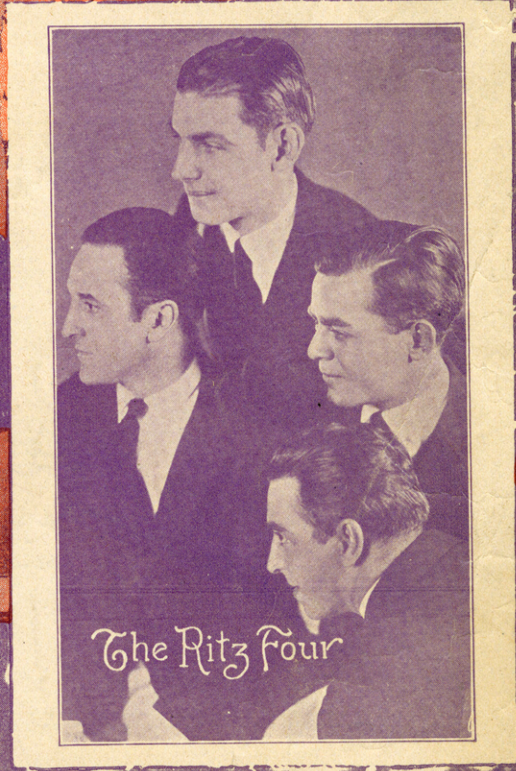
The Ritz Four

LYRIC BY BILLY ROSE & MORT DIXON MUSIC BY RAY HENDERSON