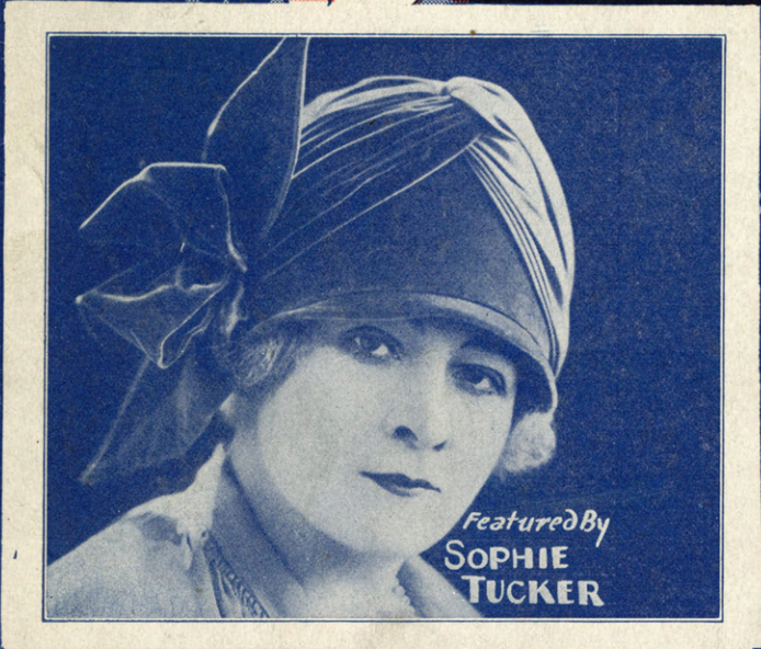
Featured By SOPHIE TUCKER