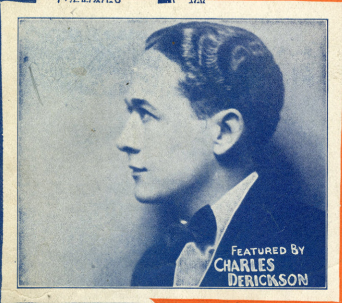
FEATURED BY CHARLES DERICKSON