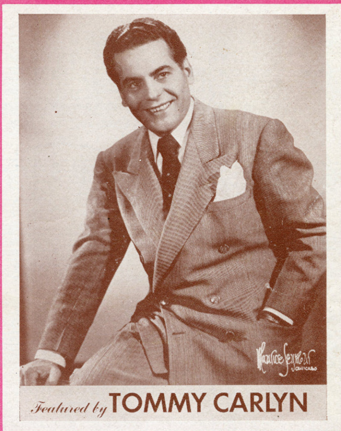
Featured by TOMMY CARLYN