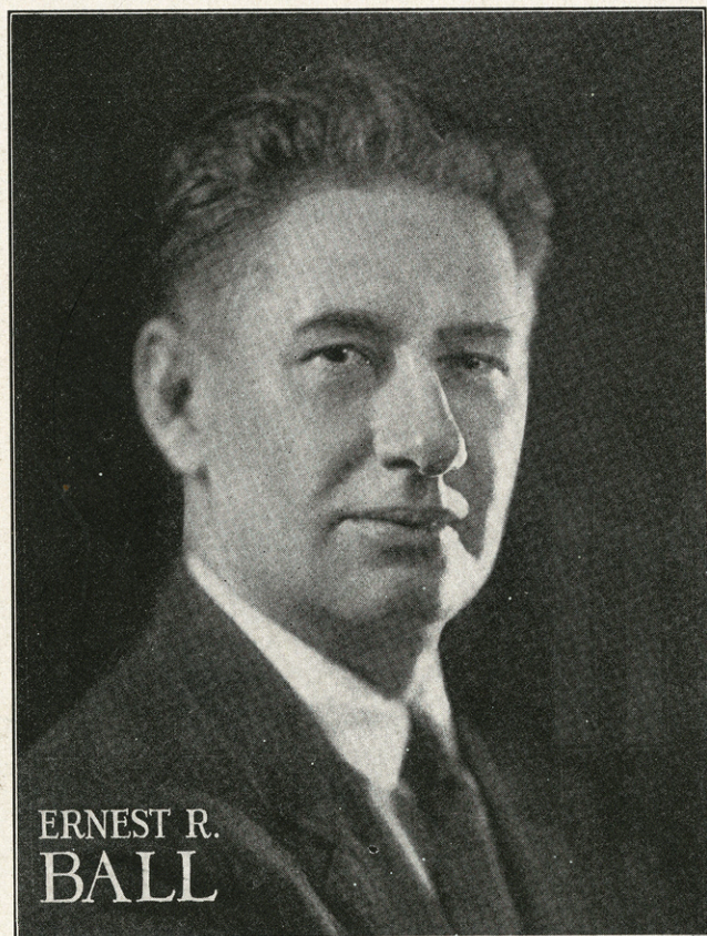
ERNEST R. BALL