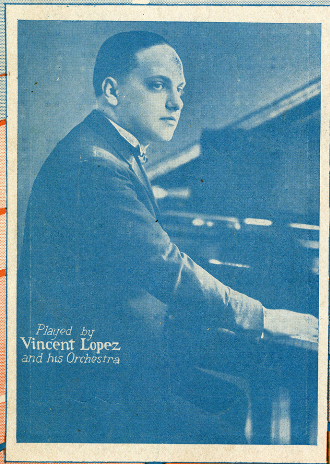
Played by Vincent Lopez and his Orchestra