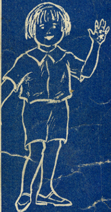
DIRTY LITTLE HANDS