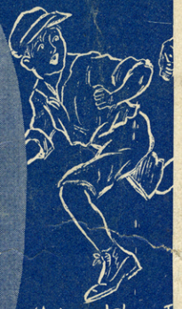
MAYBE IT'S A