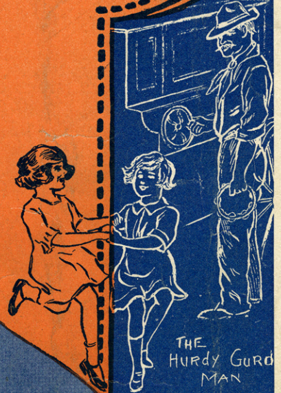
THE HURDY GURDY MAN