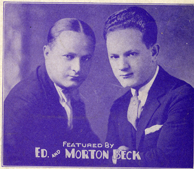
FEATURED BY ED. AND MORTON BECK