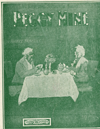
A better song than "Peggy Mine" was never written. Song Lovers have shown their approval of its value by its immense sale. Fifth Edition already on sale. Price, 50 Cents.