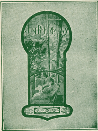
"Just Before the Dawn" has many admirers. It is a clever, original and pretty song, containing a heart-touching story admirably told, and has a chorus just such as you would make a pet favorite. Price, 50 Cents.

SPECIMEN SKETCHES OF SUPERIOR SENTIMENTAL SONG SUCCESSES OF SURPASSING MERIT. SOME SWEET AND SOFT. SOME SAD AND SERIOUS. SOME STRIKING AND STARTLING, BUT ALL OF THE SATISFACTORY SORT STRONGLY SOUGHT