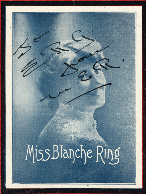
Miss Blanche Ring