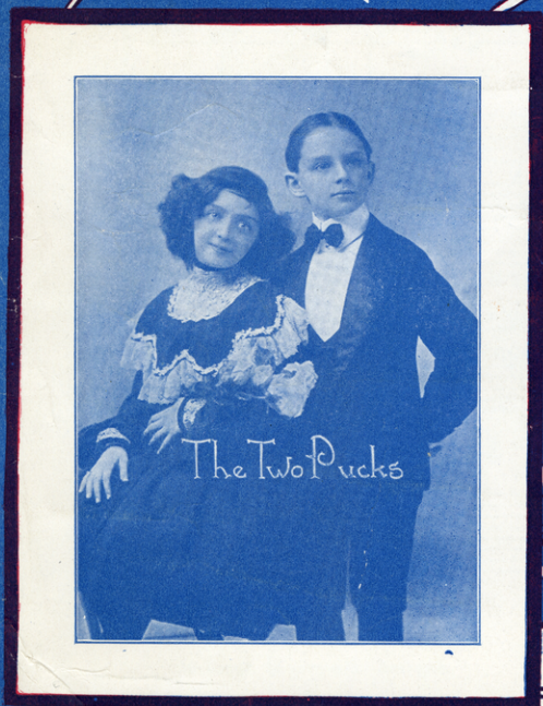
The Two Pucks