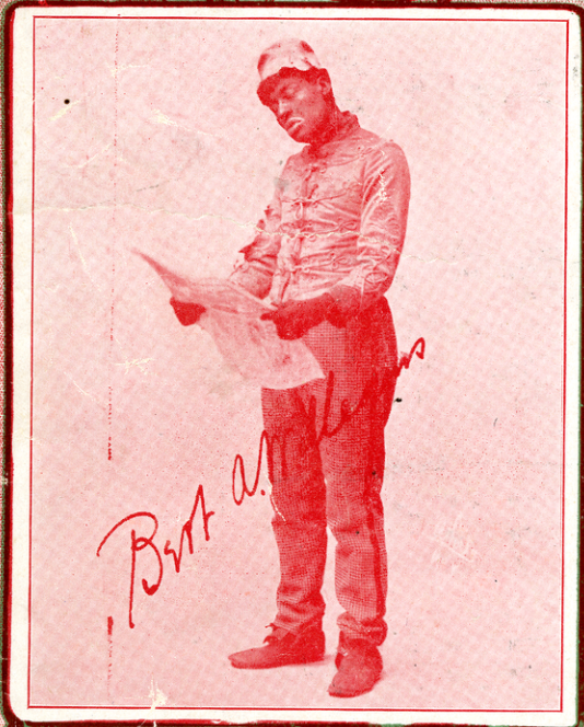
FEATURED BY BERT A. WILLIAMS IN "BANDANA LAND"

The GREATEST OF WILLIAMS AND WALKERS GREAT BIG HITS