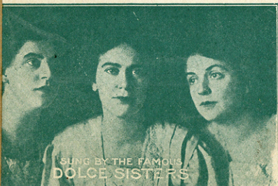
SUNG BY THE FAMOUS DOLCE SISTERS