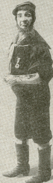
WE PARTED ON THE SHORE.