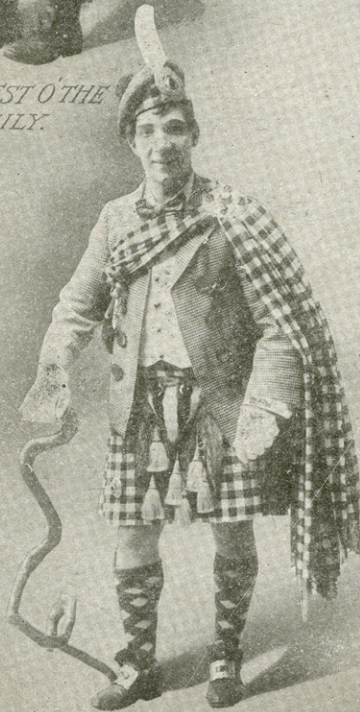
I LOVE A LASSIE.