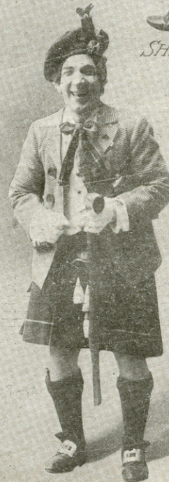
STOP YER TICKLING.

T. B. HARMS & FRANCIS DAY & HUNTER 1431-1433 BROADWAY NEW YORK