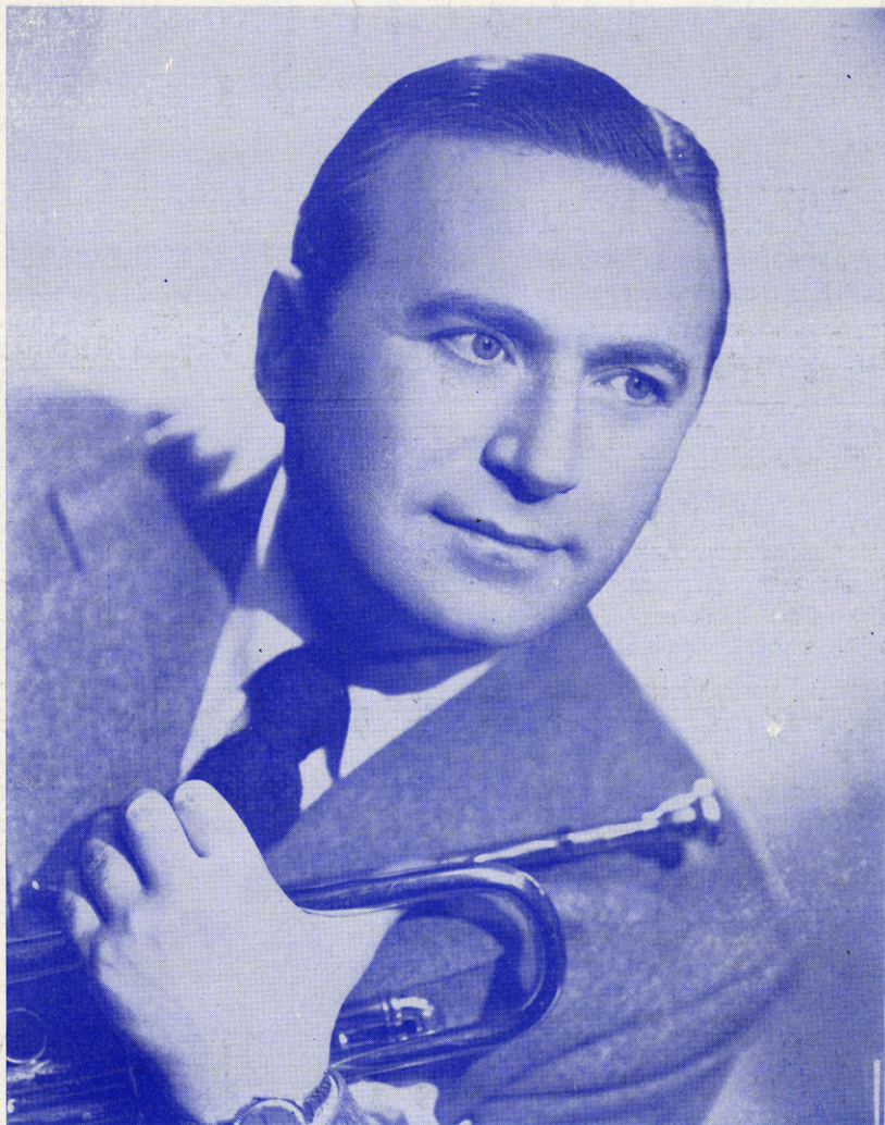
Featured by Charlie Spivak and His Orchestra on London Record (#619)