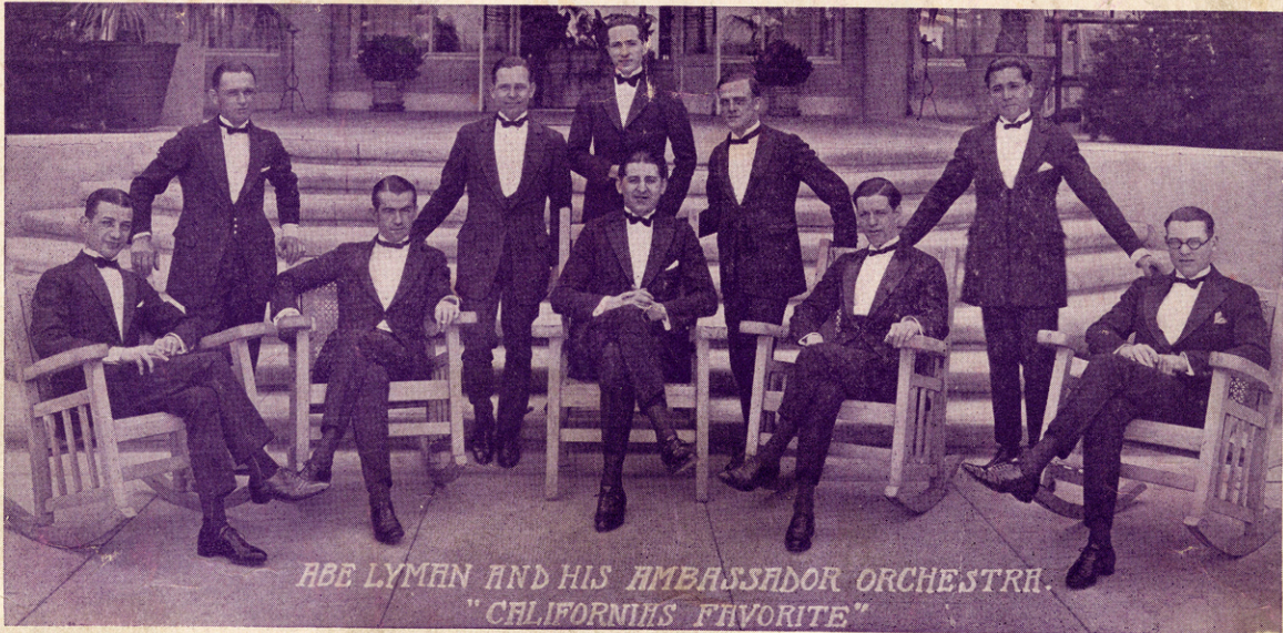
ABE LYMAN AND HIS AMBASSADOR ORCHESTRA. "CALIFORNIA'S FAVORITE"