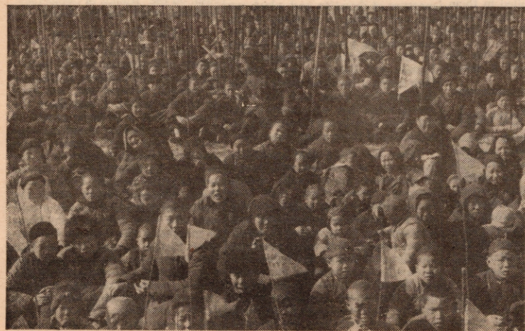
“I spoke at this mass meeting during an election campaign in a Communist-protected area. It was at a series of such meetings that the people decided to give suffrage to all men and women over 18.”