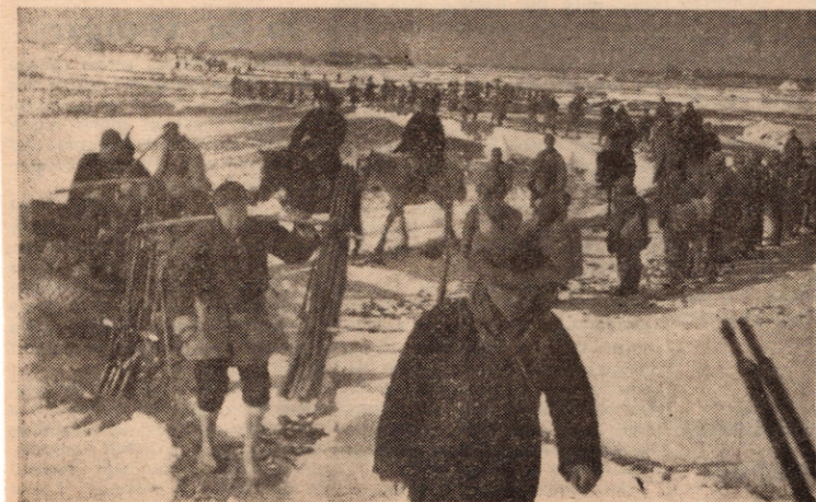
"Communist guerillas of New 4th Army return from battle with the Japanese, carrying captured rifles. Note civilian in foreground and peasant carrying rifles. Guns will be used against the Japanese."