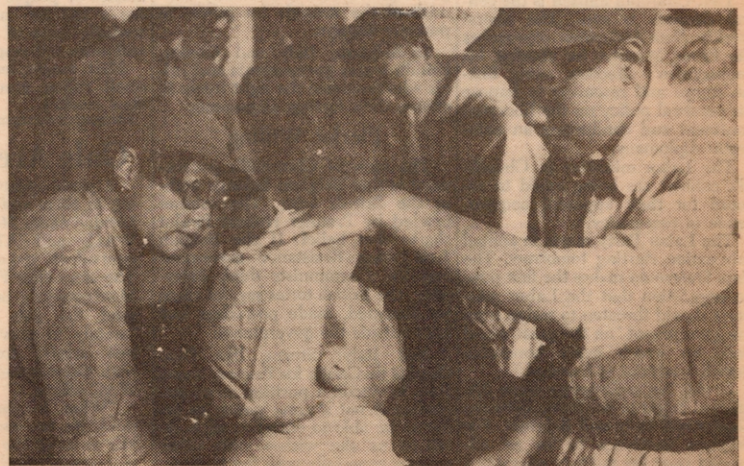
“These nurses, shown examining guerilla troops, came originally from Nanking. The post is somewhere along the Tientsin-Nanking railroad. I crossed the Yangtse River with these women.”