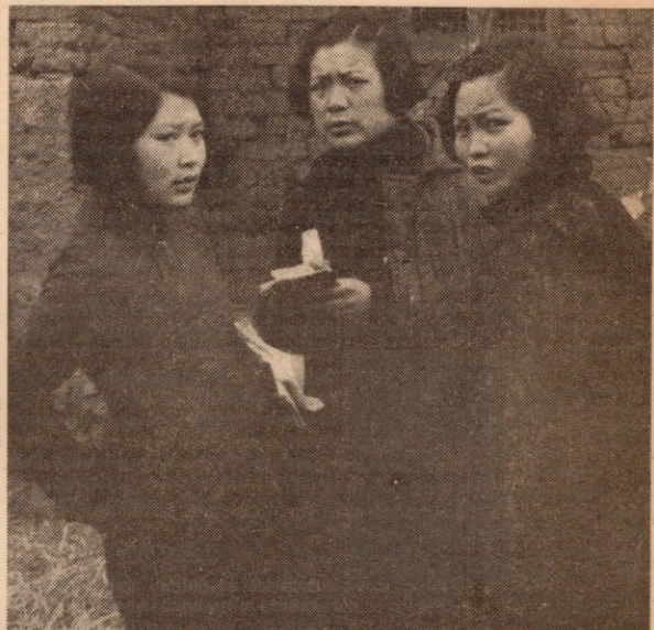
“Leaders of women's organizations in guerilla territory. Their job is to organize and educate civilian women.”

PM agrees that the letter is newsworthy and publishes it in that spirit. Following is an abbreviated version—together with some of the photographs which Miss Smedley refused to send to Life.