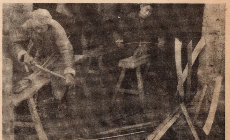
"Railway workers on Peking-Hankow line turn steel rail into big swords for the guerillas and Communist troops. Steel was taken from tracks bombed by Japanese; girders were also transformed into swords."