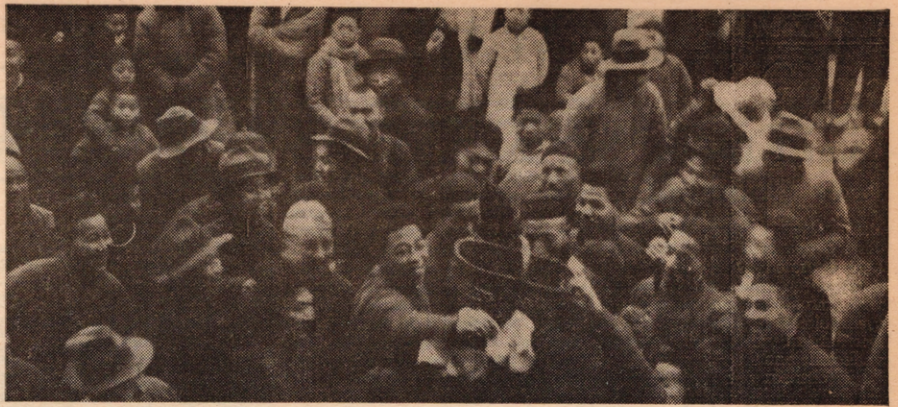
"Here's first democratic election in guerilla territory. The people were given ballot papers—red bits for 'yes' and green bits for 'no.' Names of candidates were read aloud and then a basket was held up to receive the votes."

The sick and wounded were given every possible care and received three meals a day, and even special diets. They were the only armies that even knew what special diets were. Their medical services were also at the disposal of the civilian population, totally without charge.