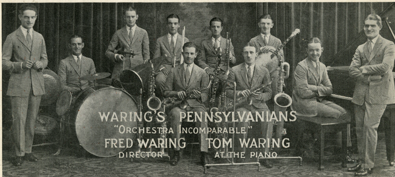
WARING'S PENNSYLVANIANS "ORCHESTRA INCOMPARABLE" FRED WARING — TOM WARING DIRECTOR AT THE PIANO