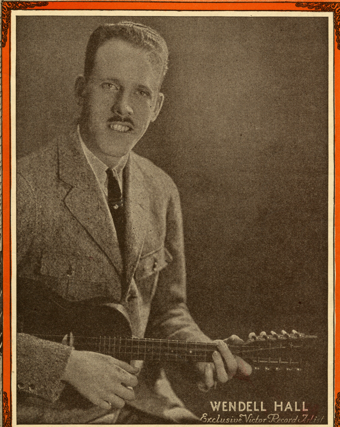
WENDELL HALL Exclusive Victor Record Artist

As sung by the National Radio Favorite - The Composer On Victor Records